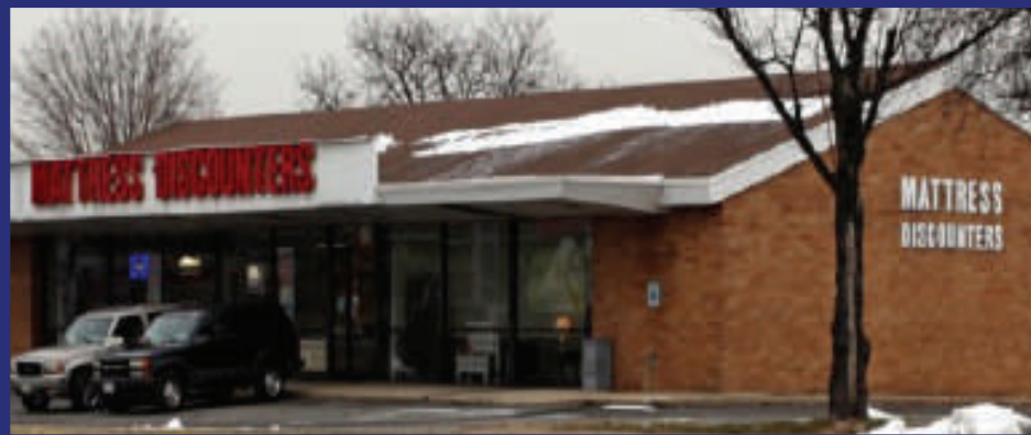
Building currently leased by Mattress Discounters